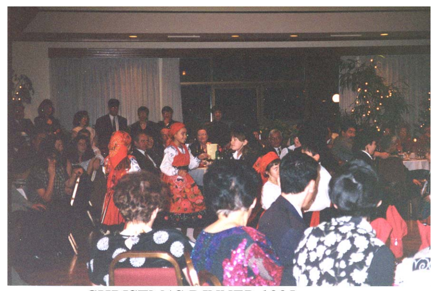
CHRISTMAS DINNER 1995

Newsletter December 1995 A night to remember, yes it was fantastic! The hall was filled to capacity, with 80% of those attending being our younger members and their friends. Fathers, mothers, daughters and sons, were all seen doing the Conga, the Limbo, the Line Dance etc. with great enthusiasm, while grandparents looked on with pride and touched by such show of unity and happiness......Yes there is no doubt that we are heading in the right direction. Our young members are responding and we can close 1995 with a sense of accomplishment and look forward