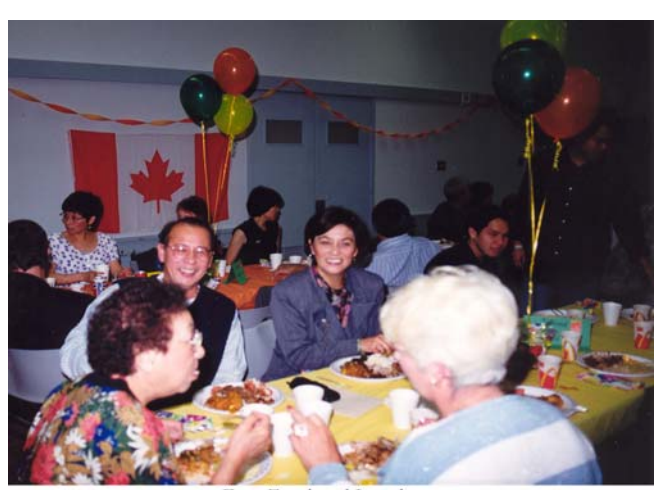
Fun, Food and Laughter