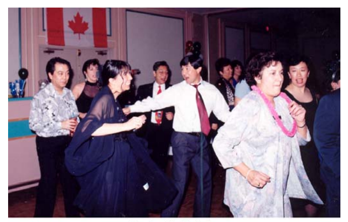
Dancing The Night Away