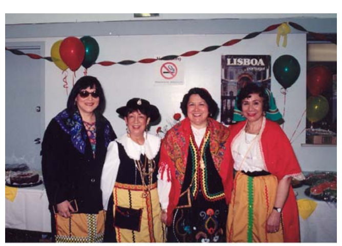
April in Portugal Dinner/Dance