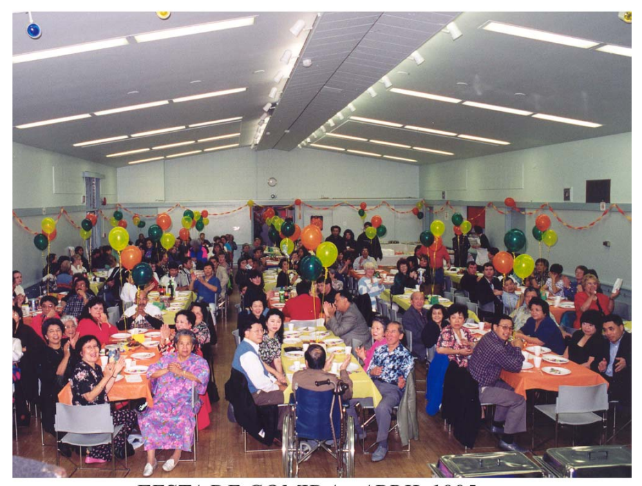
FESTA DE COMIDA - APRIL 1995