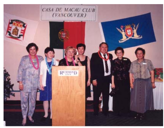
Thanks to all who volunteered