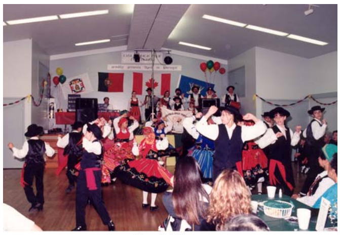
Cruz de Cristo