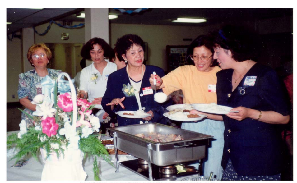
TACHO MINCHI DINNER - JUNE 1995

Newsletter June 1995 More than 100 members and guests, including visitors from Toronto and Seattle attended our May 13th Tacho and Minchi dinner gathering at Holy Name Church at Cambie and 33rd. Sixteen new members signed on. Imagine, not only your favourite two Portuguese (Macanese) dishes – all prepared in the best Macanese home-cooked way, and with all the trimmings. (There must have