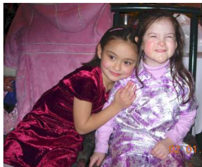
Two of our youngest members

From the cold appetizer platter to the crabs to noodles to dessert — just a sampling of the 11 dishes