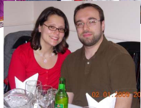
Some of our younger members and guests

From the cold appetizer platter to the crabs to noodles to dessert — just a sampling of the 11 dishes