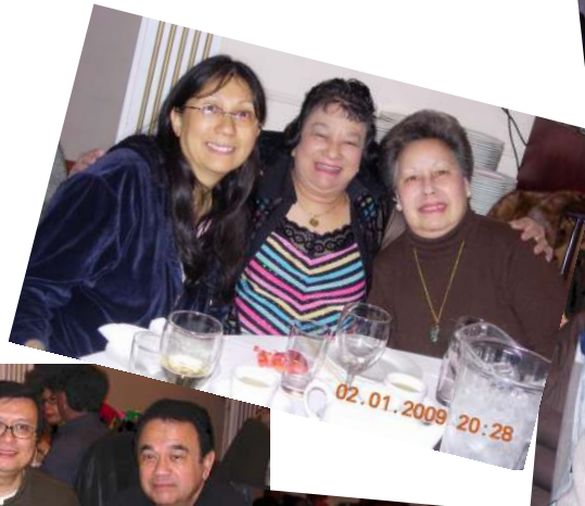
Members and guests enjoying the evening