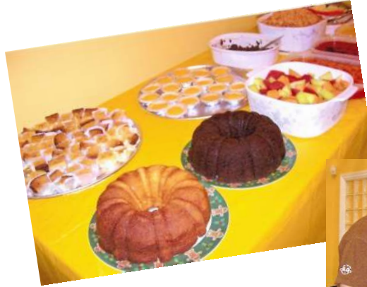
The dessert table (above) & ice cream bar (right)

We look forward to another indoor picnic as we enjoyed ourselves immensely.