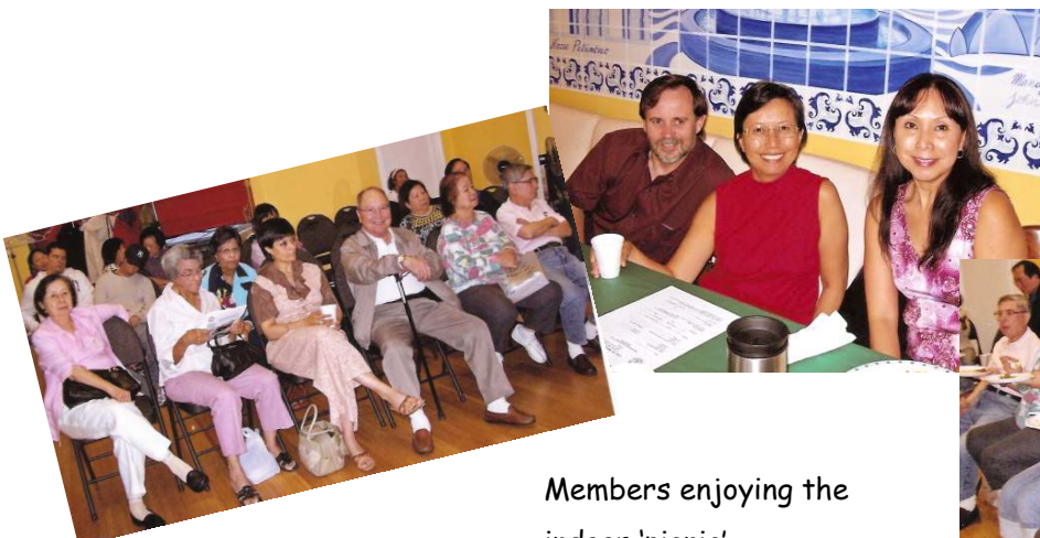
Members enjoying the indoor 'picnic'