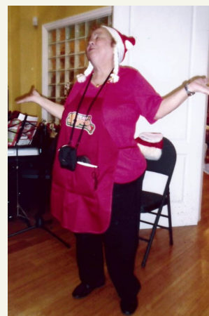
Lyce having lots of fun!