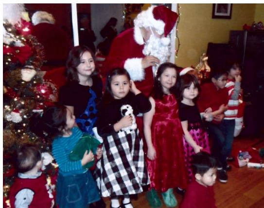
Several of the children getting ready for their picture with Santa