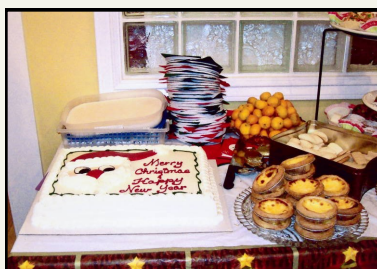
Food! Food! And More Food!!!