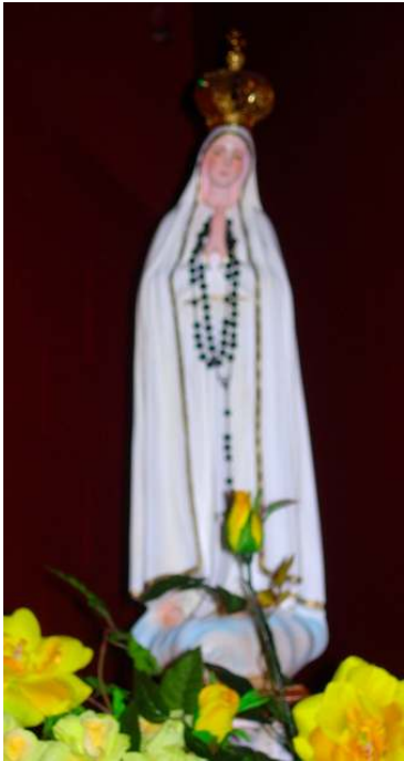
Our Lady of Fatima's constant presence watches over our sede