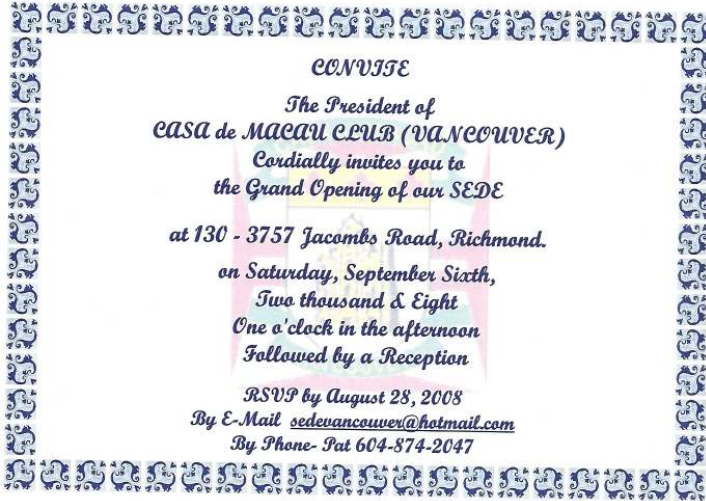
The invitation to our grand opening