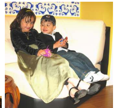
The two youngest members present, with their special prizes