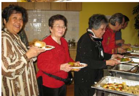
Members enjoying dinner