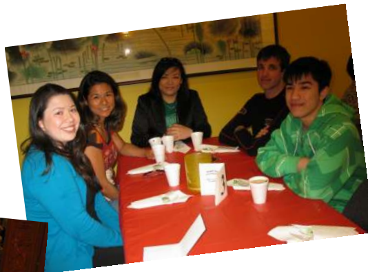
Members anticipating a delicious Macanese meal