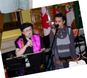
Members singing their favourite songs