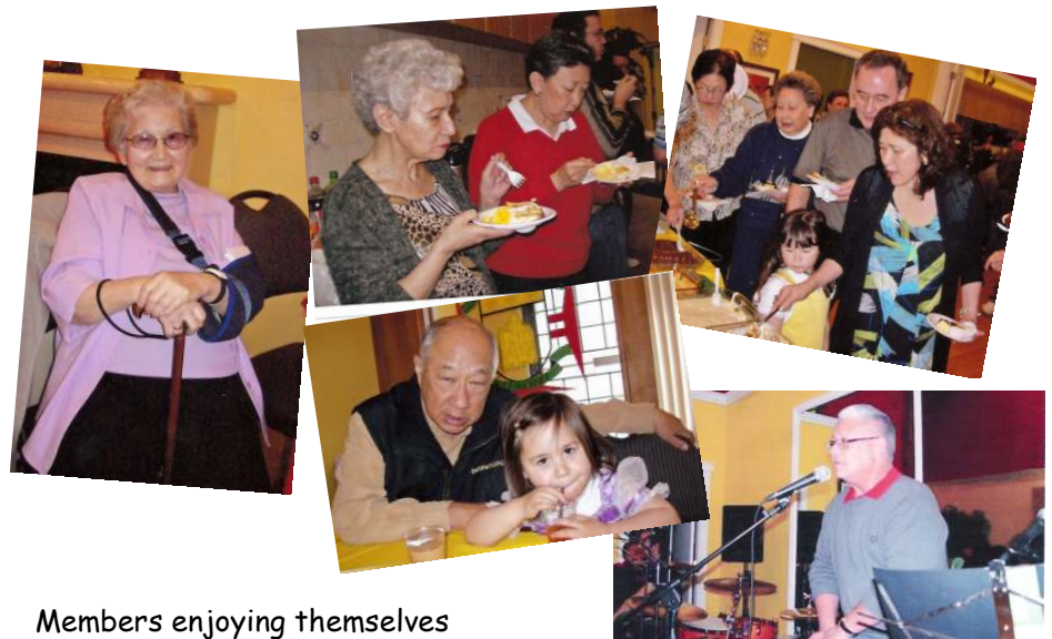
Members enjoying themselves - eating curries, singing, and listening to music

We must not forget the impromptu Go-Go dancers – nostalgia for sure .... time for me to stifle now!