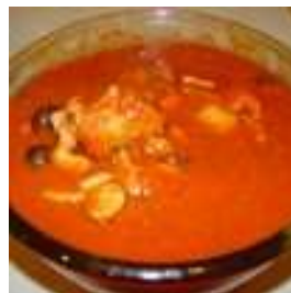
'The' Bacalhau no Forno