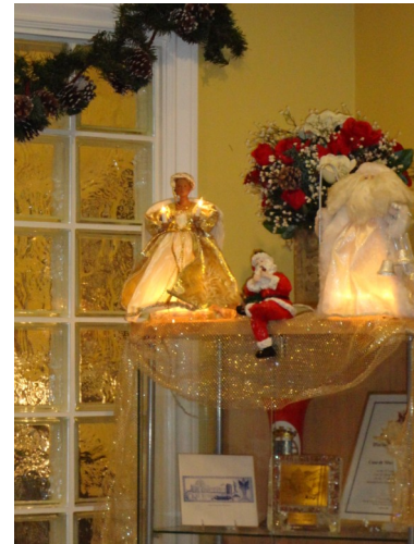
CHRISTMAS DOWN TO EVERY DETAIL

There were Christmas carols sung to everyone's heart content along with Karaoke right into midnight. Our members left with beaming smiles and feelings of being quite replete were evidence of yet another successful and lively party. Shouts of Merry Christmas and Happy New Year were heard as hugs and kisses were exchanged as the evening ended on a happy, fulfilled note.