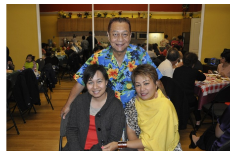
ONE HAPPY FAMILY