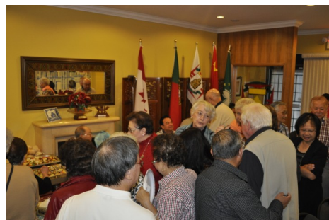
A FULL HOUSE