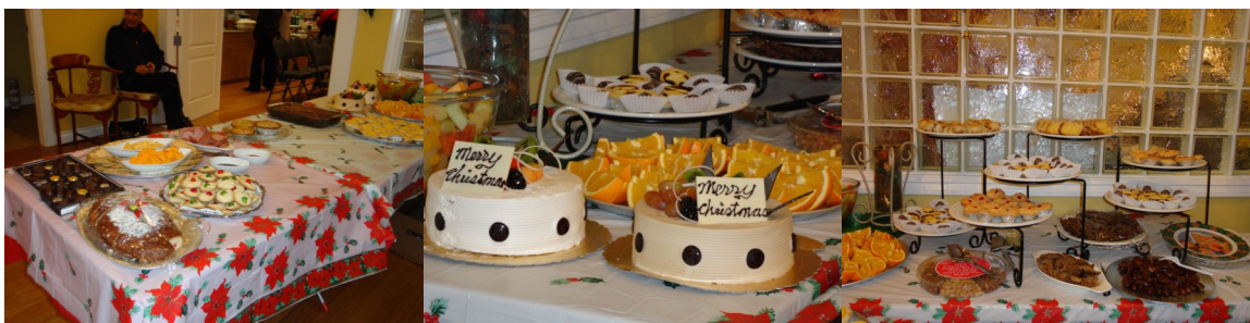
ALWAYS LOTS OF GOODIES AT THE CHRISTMAS CHA GORDO