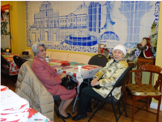
MEMBERS PATIENTLY WAITING FOR THE FESTIVITIES TO BEGIN