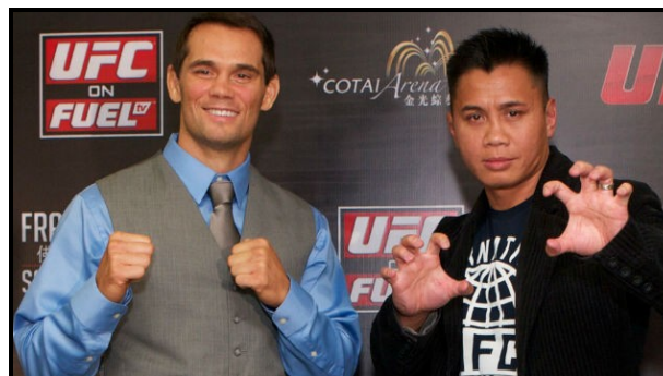
UFC FIGHTERS RICH 'ACE' FRANKLIN (LEFT) & CUNG LE (RIGHT) POSING

Due to the success of this UFC event, I feel that it will propel Macau in to the mainstream for sporting events and potentially increase tourism to the city for years to come. It is an exciting time for Macanese Communities globally and I'm proud that I have ties toward such a wonderful culture.