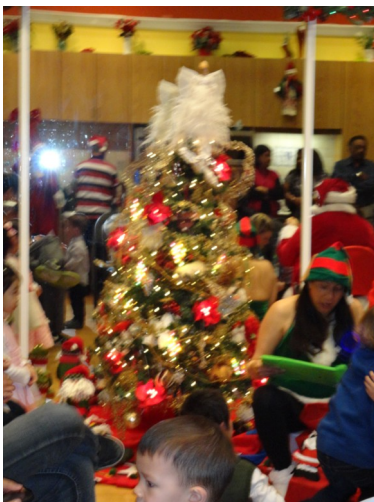
OH CHRISTMAS TREE