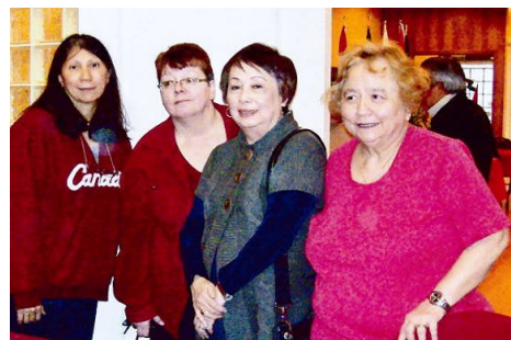
OUR CURRENT EXECUTIVE COMMITTEE