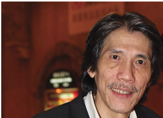
MACANESE INVESTOR & LAND DEVELOPER, DAVID CHOW