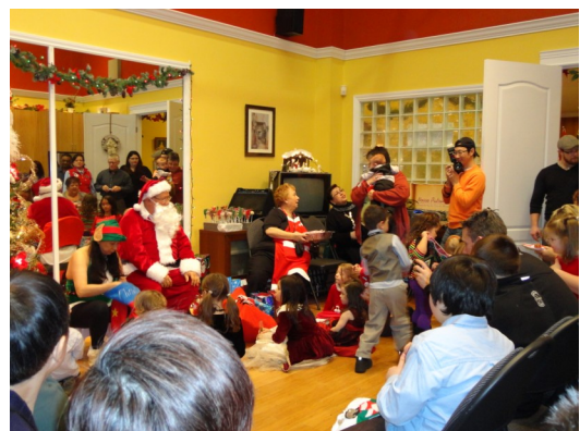
SANTA AND HIS HELPERS HANDING OUT GIFTS